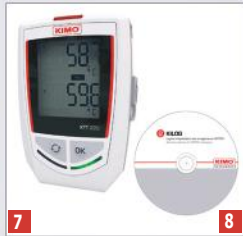
7 Data logger with 2 channels