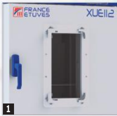
1 Door with viewing window