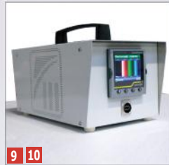
9 10 Portable paperless graphic recorder 4 or 6 channels