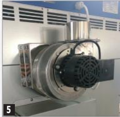
5 Air outlet extractor