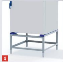
4 Subframe with feet