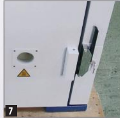
7 Key-lock door