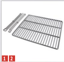
1 2 Shelf with guide bars