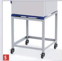
5 Subframe with castors