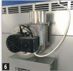
6 Air cooling extractor