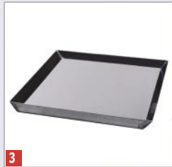
3 Recovery tray