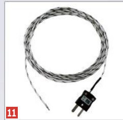
11 Thermocouple J probe