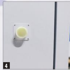
4 Entry port Ø 60 mm