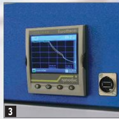
3 Temperature profiler and recorder