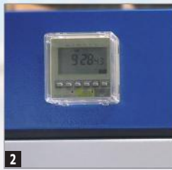
2 Digital weekly program timer